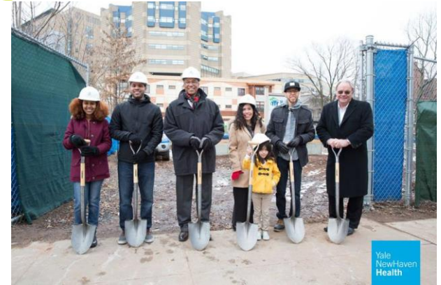
Groundbreaking at 45 & 47 Vernon Street