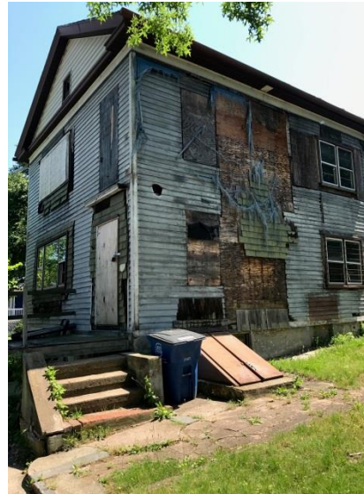
387 Lenox Street, New Haven (before & after)