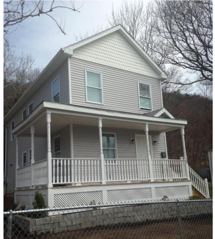
13 Rock Creek Road, New Haven