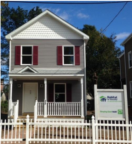
55 Redfield Street, New Haven