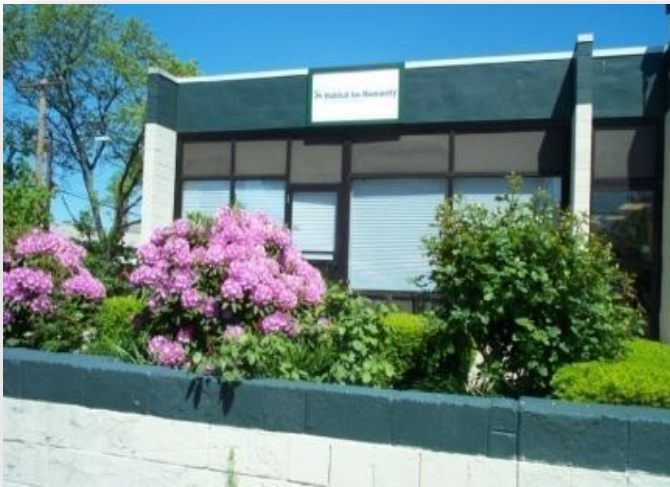
Our office at 37 Union Street, New Haven