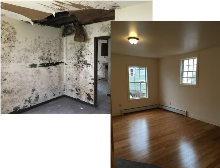
387 Lenox Street, New Haven (interior before & after)