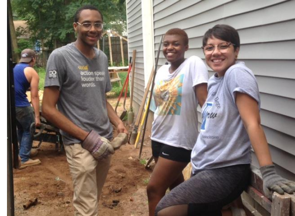
Albertus Magnus volunteers