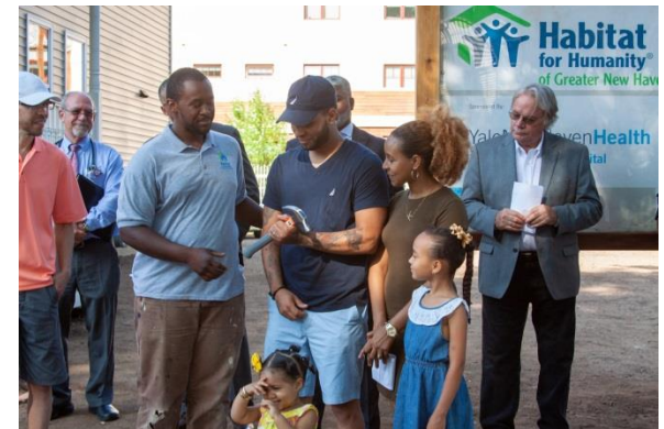
Dedication of 45 & 47 Vernon Street, including Habitat's traditional "Passing of the Hammer"