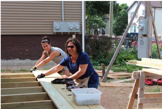
United Bank volunteers