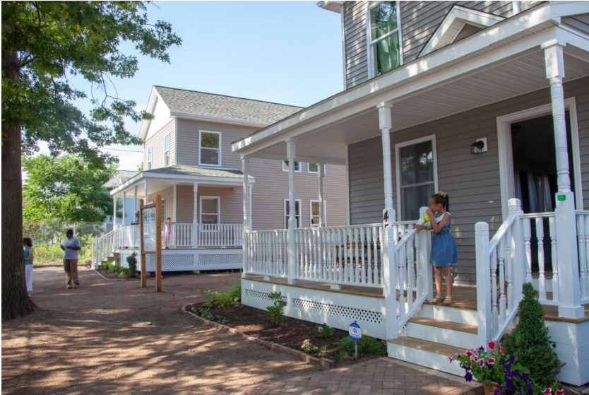
45 and 47 Vernon Street, New Haven